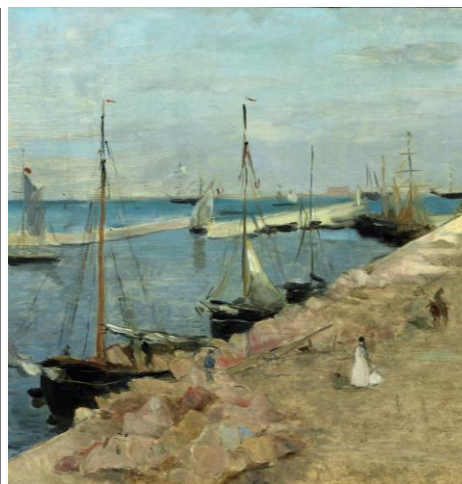
MORISOT, The Harbor at Cherbourg