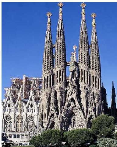
GAUDÍ, Sagrada Família