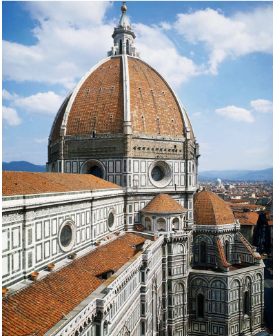
FILIPPO BRUNELLESCHI Duomo, Florence