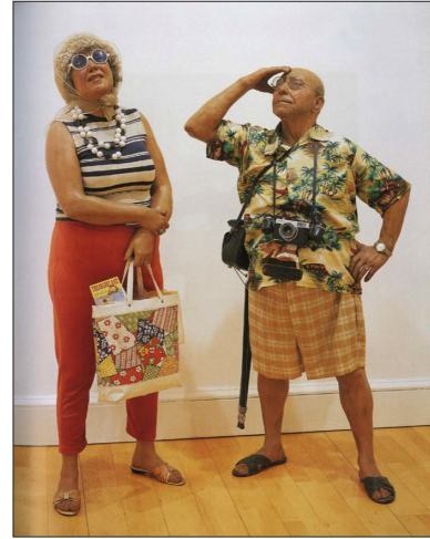
DUANE HANSON Tourists

The speakers—a painter, an architect, and a sculptor, all Terrain Gallery coordinators—show the thrilling practicality of art for people’s lives today. Eli Siegel, critic, poet, and founder of Aesthetic Realism, described it in this landmark principle: